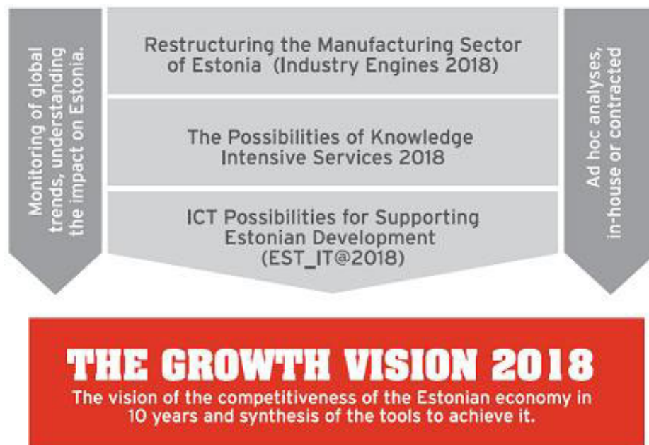
Fig. 2. Growth vision 2018. The Development Fund foresight framework 2008-2009

EDF creation initiated important changes: research projects of the Estonian Development Fund give meaning to Estonian economic Development. Joint brainwork and interpretation of the trends and signals coming from the external environment into the Estonian context give input for the broad-based foresight work. Development Fund's 2008 foresight projects: Industry Engines 2018, IST_IT@ 2018 and Service Economy 2018 (see Figure 2).