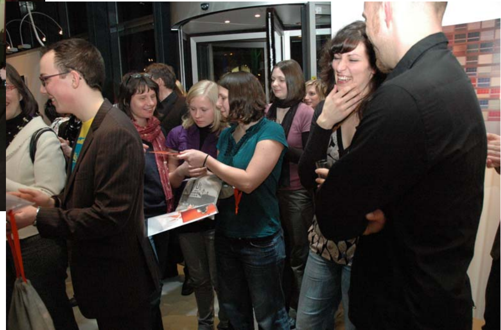
Opening of exhibition “Show us the creative people!”